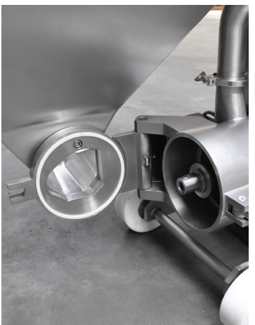
Motor shaft Hopper